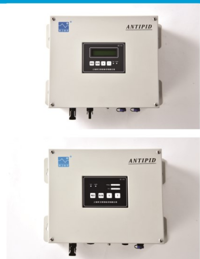
ANTIPID03 / ANTIPID04